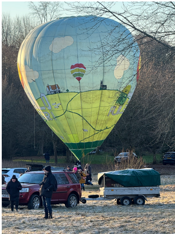
Cameron H-20 G-BRCO tethered on Saturday morning.