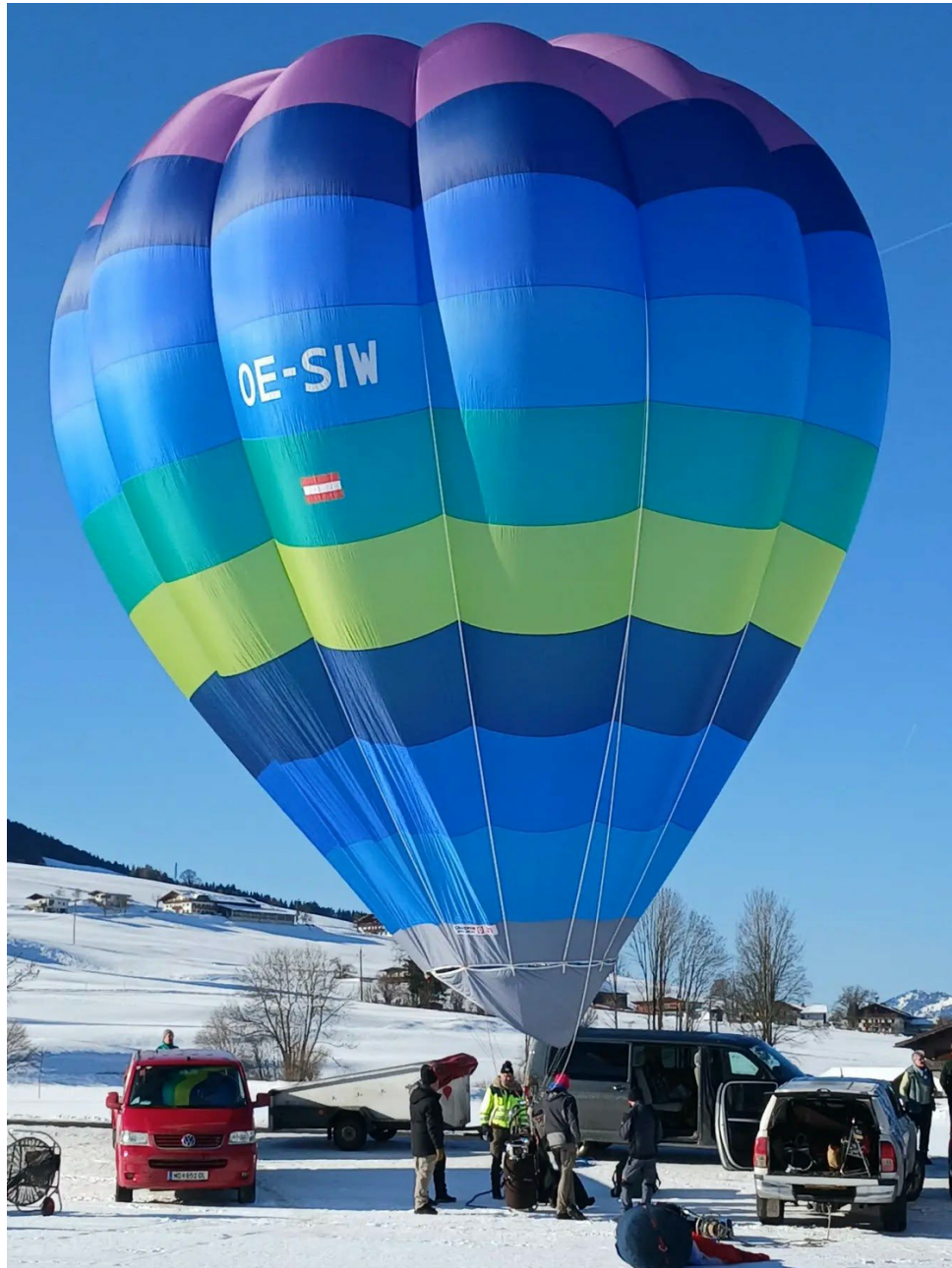
OE-SIW Cameron O-31- photo by Harold Dunst.