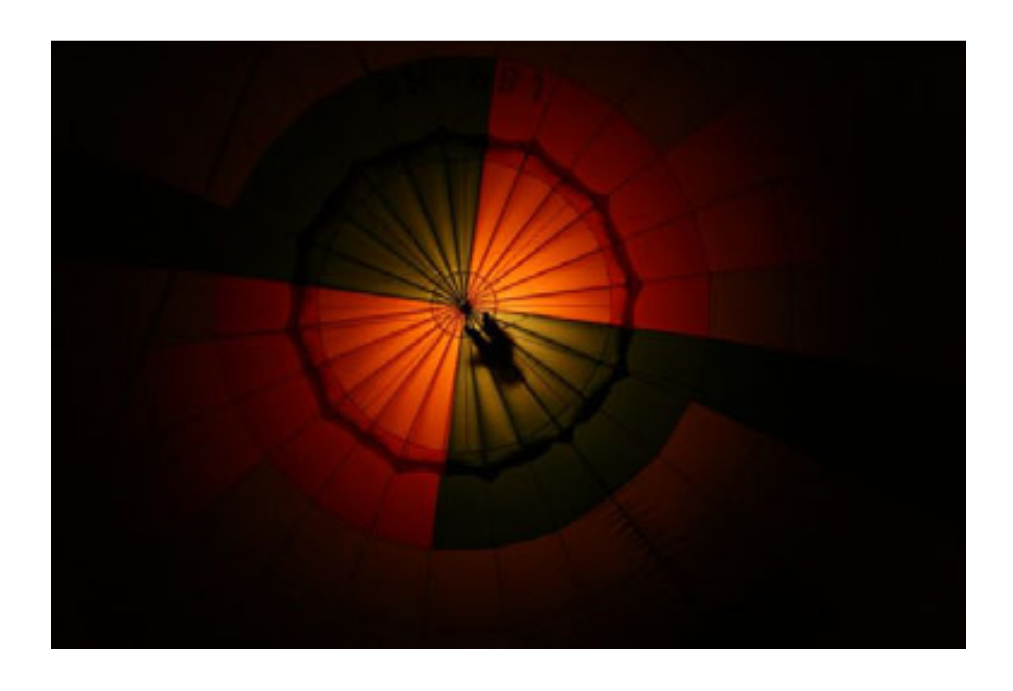
And a view of the "Hot Seat" from inside the 120! Cheers, Pieter Kooistra.