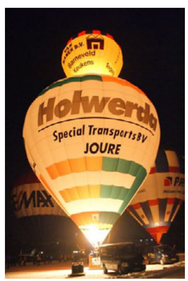
"Stacked"! The hopper on top of the 120 during the nightglow

I quickly closed the parachute and vented from now on with both side vent lines open. The proof that Rupert was ok came a few minutes later when he called me in the basket and ordered one beer and a Bratwurst!