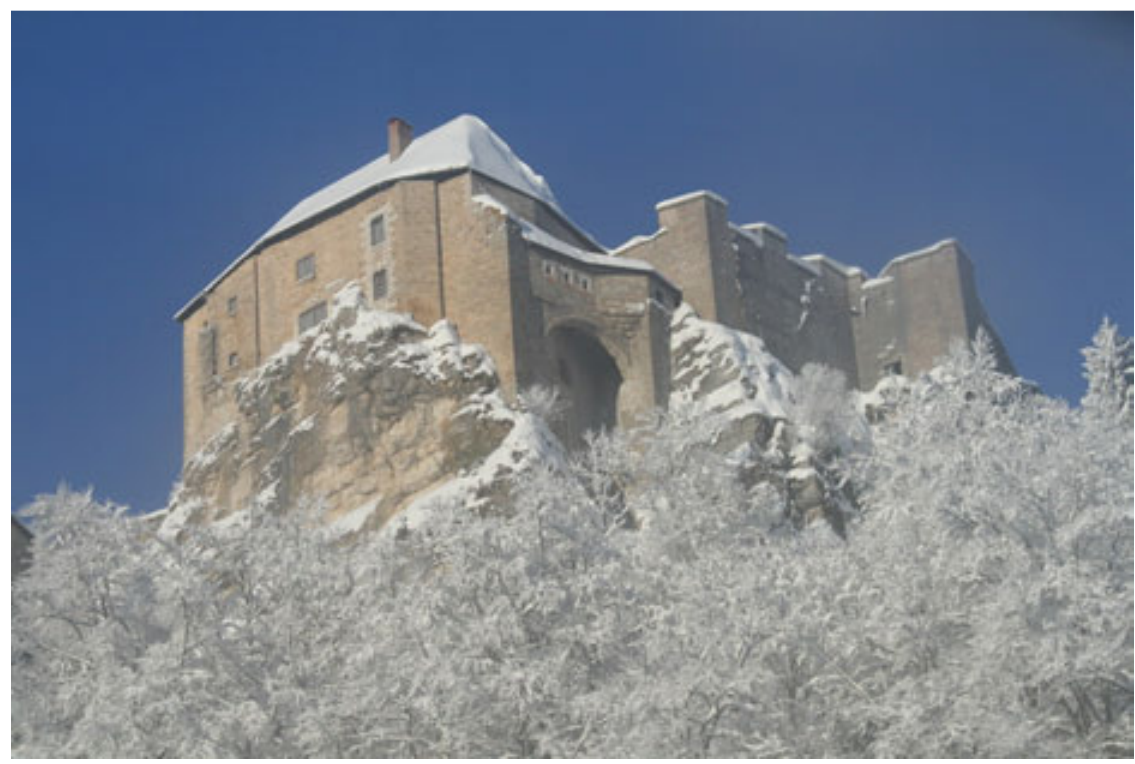
Despite the St. Niklaas video, this was an extremely good meet with some flyable days and lots of beer and general naughtiness. Roll on 2011 we WILL be back. Martin & Sandy

the balloon roundabout and head off up the hill through the mountain pass. Saw the temperature hit a relatively warm -17^{\circ}C as we hit the top of the pass and make the downhill decent towards Lake Geneva. Now leaving Switzerland and it's the single carriageway pass over to the French auto route system. This proved to be extremely cold, as the cars outside air temperature sensor bottoms out at -24^{\circ}C . All I can say is that the Swiss Alpine diesel works well. This was OK until Sandy decided to open the window to take this shot at which point the inside of the windscreen instantly froze.