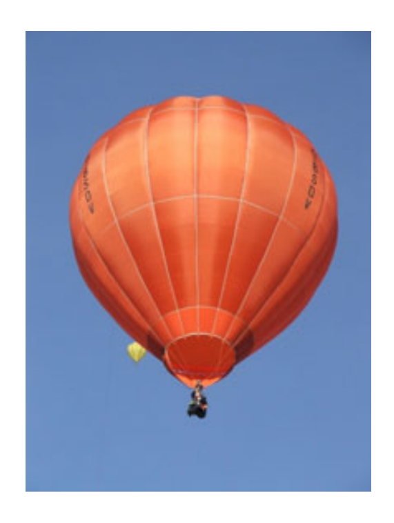
Ready for a new owner in 2010 -who will buy G-BSDV Colt 31A?

Your editor is selling his Colt 31A Envelope, registered on 19thApril 1990, she has done 76hours 15mins (last flown 21<sup>st</sup> march 09) and cold inflated in July 2009. Lapsed Cof A with EASA agreement to be renewed. She is now surplus to requirements as I can't fly two at once.