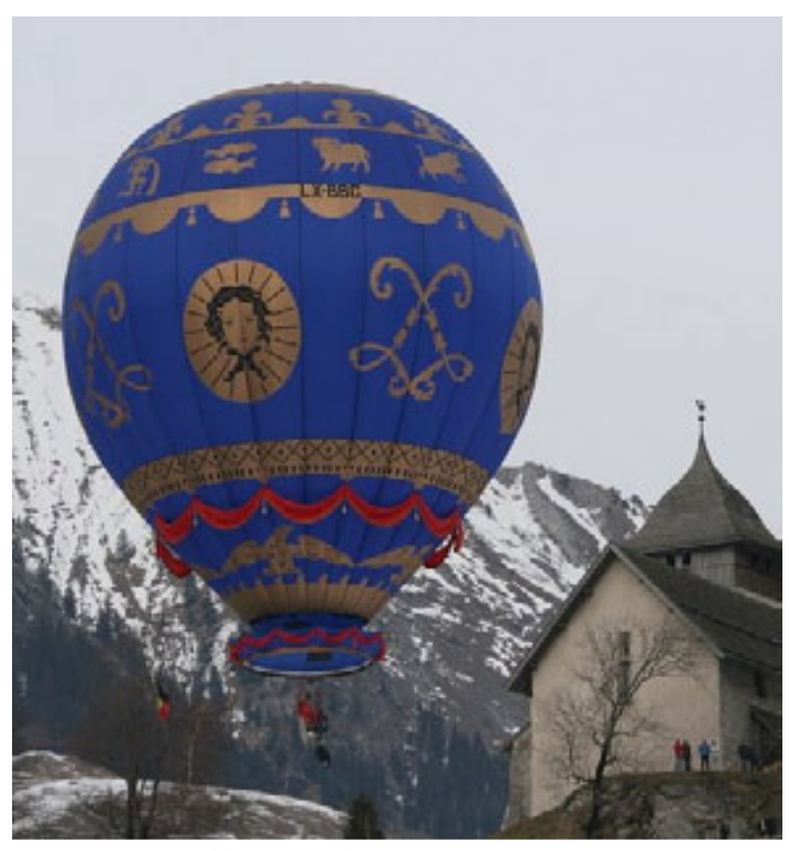
The following hoppers flew today: