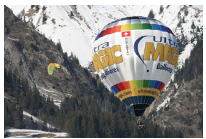
Monday 25<sup>th</sup> - No flying, Tuesday 26<sup>th</sup> - No flying, Wednesday 27<sup>th</sup> - No flying.