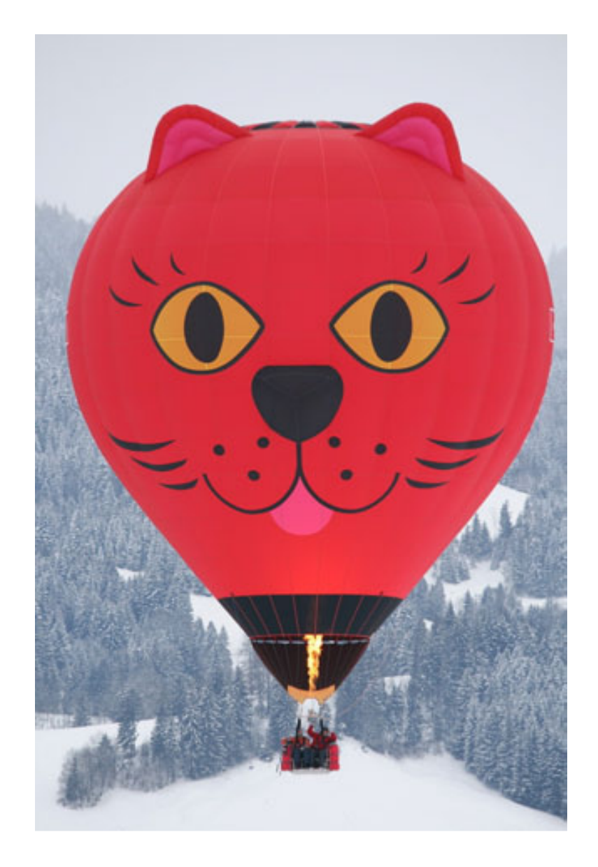
The weather was not too good today so only a tether.