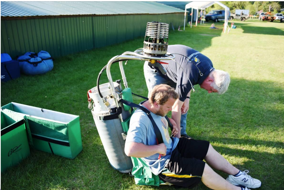
Showing the Bonnano hopper to a potential customer