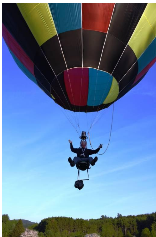
Simply having a blast in a Bonnano hopper

Once assembled the inflation process is exactly the same as on other hoppers and as the balloon becomes upright, you transfer to a very comfortable seat and strap yourself in for the flight. The top two straps have loops on them and the lower left hand side has an extended tongue which you feed through the top loops and engage into the RHS lower strap clasp. Finally to ensure safety you engage an R clip which prevents detaching in flight. Surveying around the flight environment, there are plenty of pockets for stowage and also a nice neat handling line which can be a handy thing to have. So I hear you ask, what does it fly like? Truthfully its lovely, the burner is a work of art, with a lovely action. The seat support worked well for well over an hour, but if I was moved to criticise anything, it's the lack of a mirror to check your fuel contents. I flew by knowledge of the contents of the tank and using my watch but it is reassuring to be able to check with a mirror.