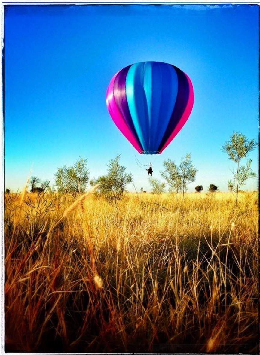
Awesome photo of Steve Griffin on approach to land