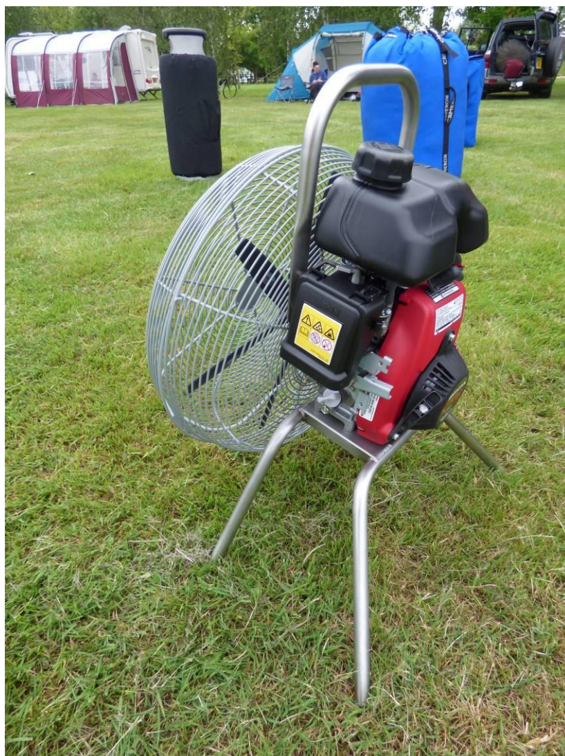
A couple of views of the new Cameron Mini Fan

This section is the Editor's choice of new jpegs, visuals and older balloons of interest or alterations. If you know of a new or interesting hopper or Duo that hasn't featured in this section, and then feel free to forward details of it with a suitable photograph to me using my normal email address.