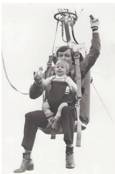
Sent in by Vincent Fossey