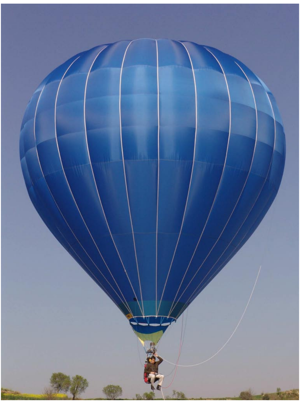
Brand new Ultramagic V-25 for Austria .c/n is 25/02.