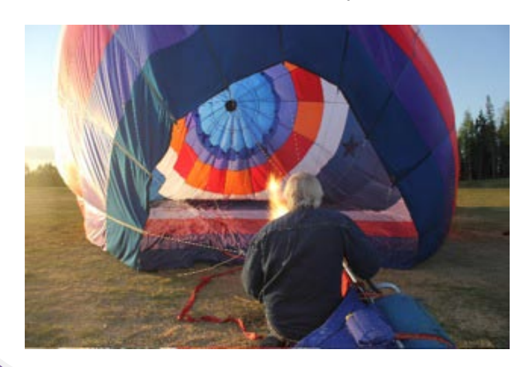
Jack test inflates the hopper

Following a short build period, Jack Klein has just finished his latest project which just happens to be a 35,000 cubic feet hopper. Without revealing all his secrets (because I'm hopeful jack will write a full article on the project), some details are known. The 16 Gore design weighs 72lbs or 32.7 kgs without the scoop. Finished on the 13th of May, Jack needed to wait a few days before he could test inflate and adjust a few lines.